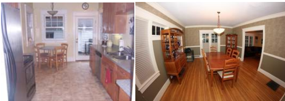
Remodeled kitchen, dining room, family room with fireplace and vintage black & white bathroom

Christmas shopping is easy with all the independent shops located on Bardstown Rd.